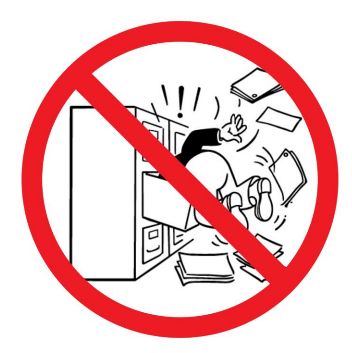
No more digging around in filing cabinets!

To draft a document control system for Norco College which will improve accuracy and access to important documents. This system will be instrumental to maintain document integrity and traceability as we evolve and grow.