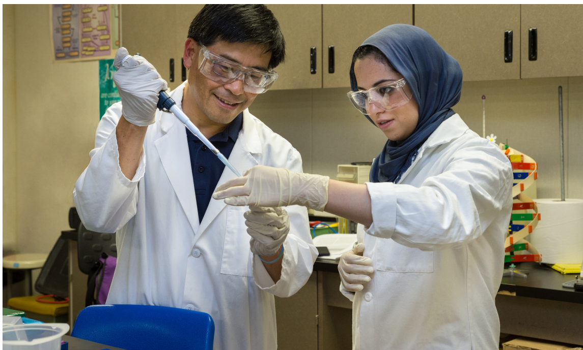
An American River College student and her instructor in the lab.

In May 2009, the California Community Colleges Board of Governors approved changes to California Code of Regulations, title 5, §53407 and §53410 to allow the creation of a third option within the minimum qualifications to be defined requiring a bachelor's or associate degree in a specific discipline, plus requisite years of professional experience. The four types of discipline lists contained in this handbook are identified on the opposite page.