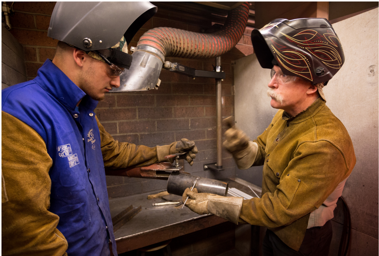
An American River College welding student with his instructor.