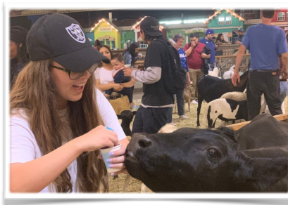
CSA Bergen and Cow, LA Fair