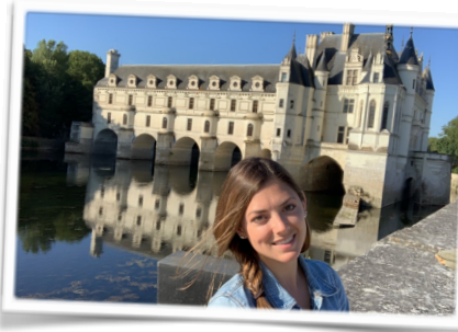
CSA Diaz, France