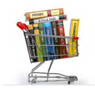
Step 7: Pay Enrollment Fees

Step 8: Get Your Free RCCD Student Photo/ID Card at Your Home College