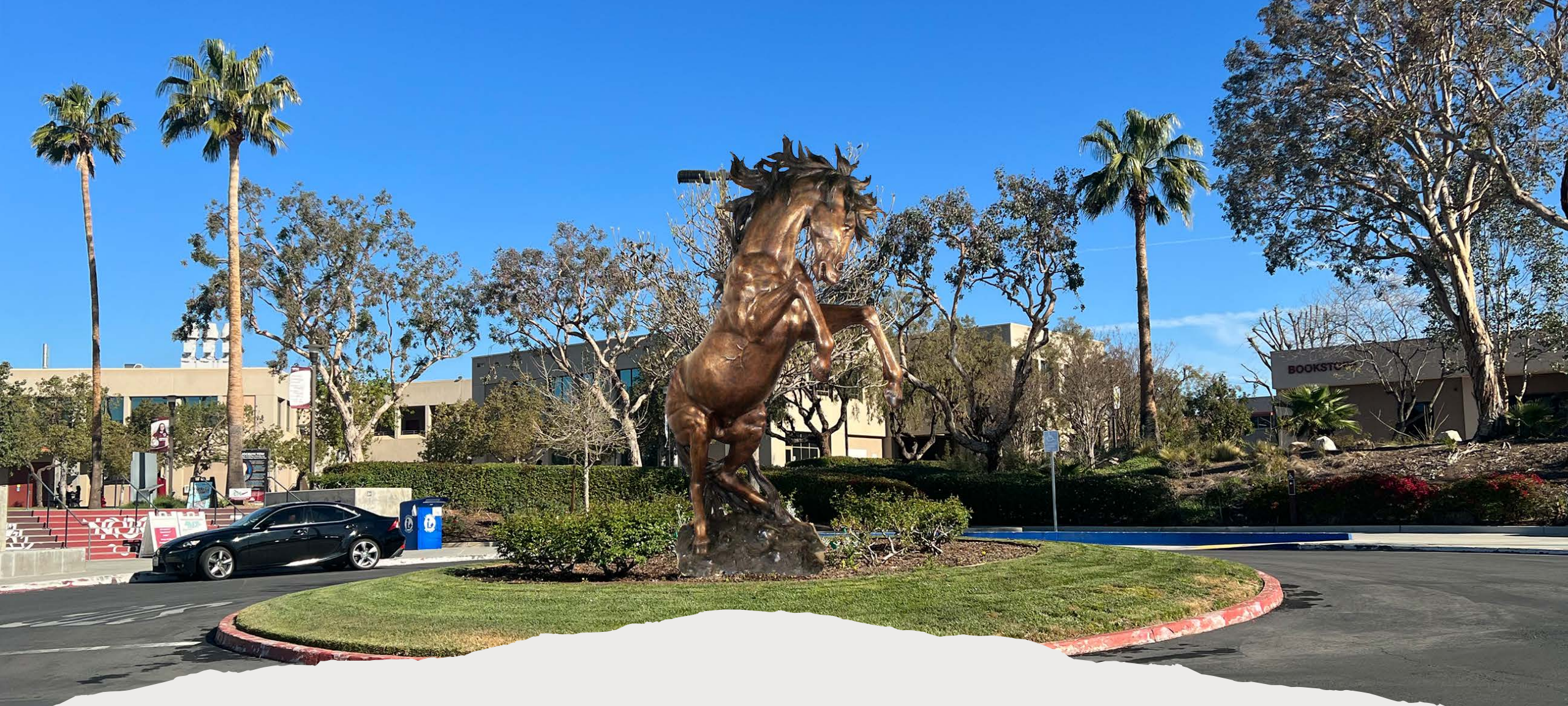
Statue 1: Round About