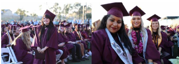
The future belongs to those who believe in the beauty of their dreams!